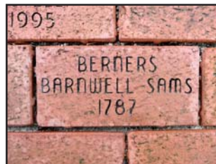
(Top photo) A sample of one of the engraved bricks.