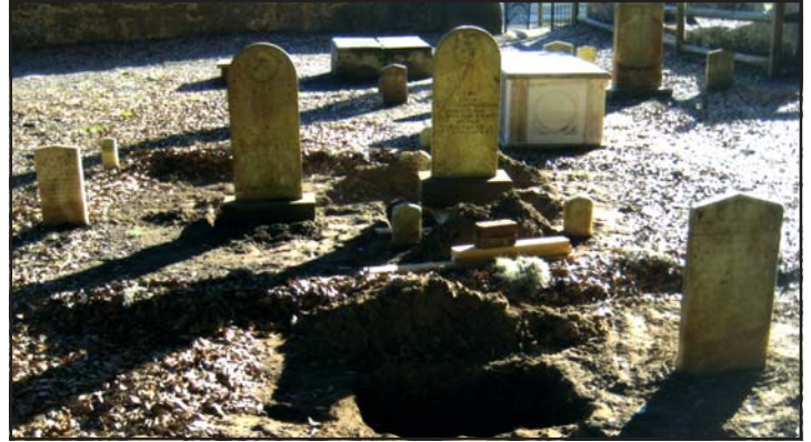
(Above photo) The work at restoring the grave markers.

If you have not yet placed your "footprint" on Dataw with your own heritage brick, now is the time to do so. Brick order forms are available at the Cannery, Clubhouse lobby, or can be downloaded from the Members/Clubs page of Dataw.org .