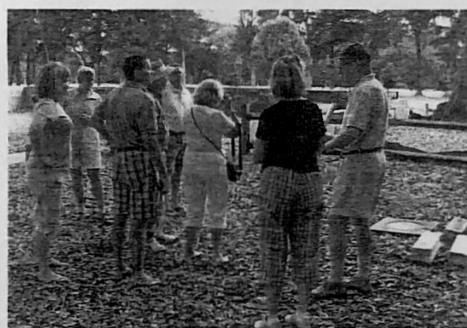
Exploring the Sams Cemetery.