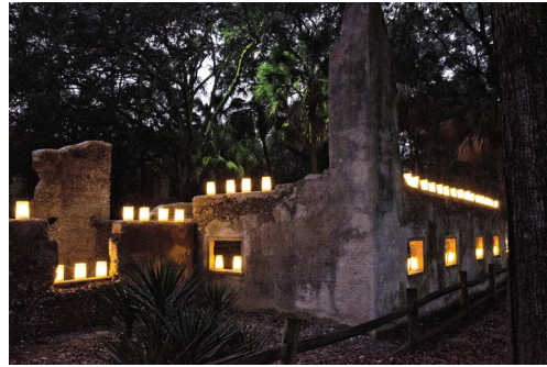
The Dataw Ruins, Luminary Night